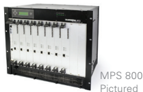
MPS 800 Pictured

The TANDBERG Media Processing System (MPS 800, MPS 200) is ideal for enterprises requiring ISDN, V.35 and IPv6 support. Its gateway capabilities also enable seamless integration of the TANDBERG Codian MCU 4,500 for high-definition applications.